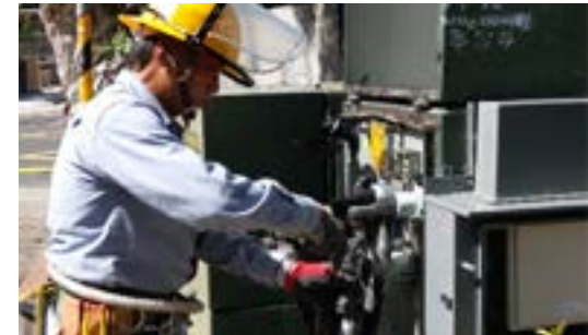
Figure 6: On the top, meter and communication module installation. On the bottom, ground level base station installation.