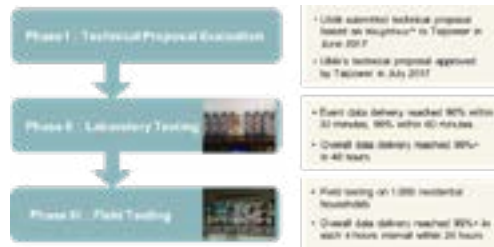
Figure 5: Qualifying tests required by TPC to be eligible to implement AMI in Taiwan.

During evaluation of technical proposals, an extensive series of questions required detailed responses. After this, during the second phase a laboratory test of 1,250 smart meters with installed connectivity solutions from vendors was undertaken in a simulated environment. In a third and final phase, field tests in real world environments were executed. In these tests, wireless deployment in some of the most challenging city environments were undertaken. Ubiik's performance and success in these field tests showed just how effective it was at implementing solutions for AMI. Ubiik was among the top 4 vendors and was awarded three regions of Taiwan (Northern, Central and Western) for AMI deployment.