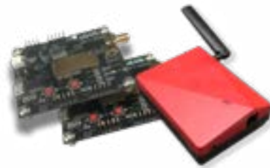
Figure 3: The Weightless Starter kit provides developers with everything needed to deploy, test evaluate, and prototype using Weightless LPWAN technology

Ubiik adopted the Weightless-W protocol as a starting point. The protocol had aimed to solve the problem of connectivity needs for wireless sensor networks. It utilized TV Whitespace—the unused bandwidth between TV channels in the broadcast frequency spectrum. Unfortunately, the regulatory issues made its use complicated and applicable only to a limited set of use cases. To address these challenges, Ubiik developed a new, simplified and more full-featured version of the Weightless-W protocol initially known as Weightless-P. This was made into an open standard by the Weightless SIG and eventually renamed to just Weightless. Ubiik brought this specification to life embedding the protocol stack into two main hardware components: the base station and end device module. It was the development of this first module and base station that began the pathway for Ubiik into the AMI business.