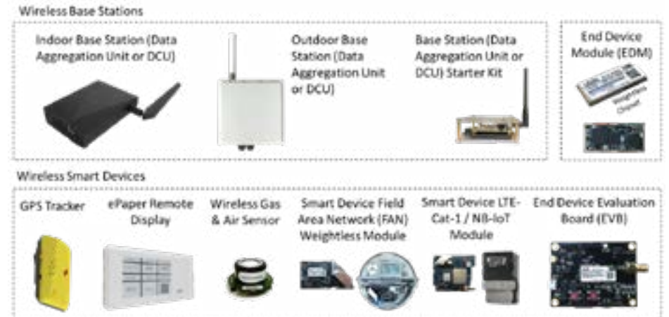
Figure 2: A partial snapshot of Ubiik’s wireless solutions portfolio.

Furthermore, Ubiik also provides solutions for backend and cloud platforms providing comprehensive Software as a Service (SaaS) tools for smart devices. Users and vendors can leverage Ubiik’s existing connectivity infrastructure provided by DCUs to connect their devices much like they would with 4G or other cellular technologies. Here, a whole host of smart city applications are possible For further information on Ubiik’s products check out the website at: www.ubiik.com .