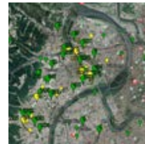
Figure 4: Map breaking down TPC regions for which Ubiik has deployed smart meter connectivity infrastructure during its 2018 contract.